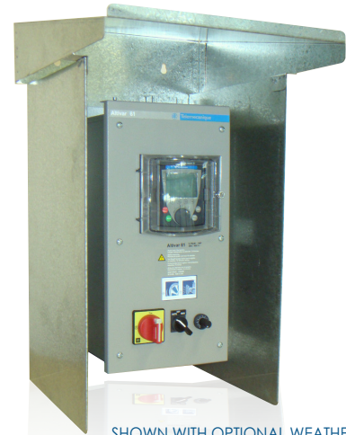
SHOWN WITH OPTIONAL WEATHERSHIELD