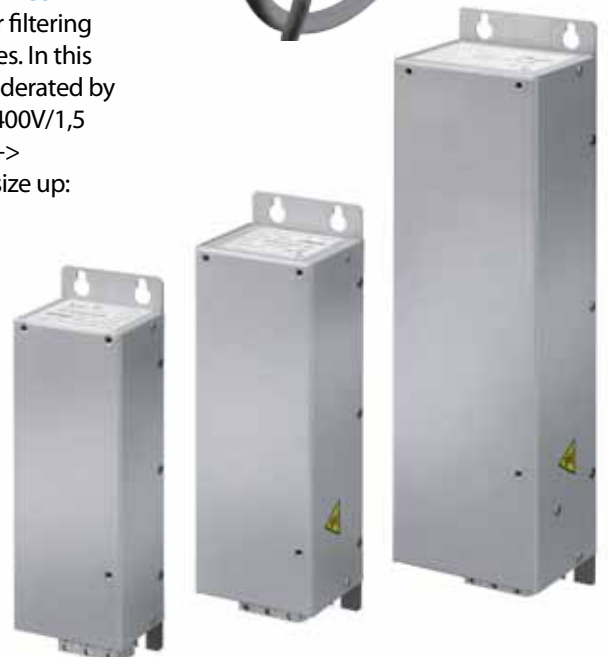
Frame sizes Three different frame sizes of line filters correspond to the M1, M2 and M3 enclosures of the VLT® Micro Drive